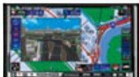
Navigation system integrated with AV system for Japanese market (with built-in One-Segment TV tuner)