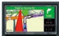
Navigation system integrated with AV system for overseas markets (All-in-one type)