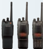
Digital Land Mobile Radio